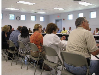
City and County United Way Departmental Coordinators attended training at Jack McLean Park.