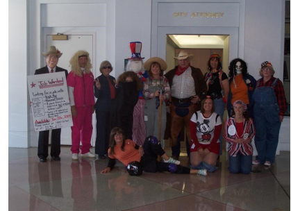
Employees from the Office of the City Attorney pose in their costumes during Halloween.