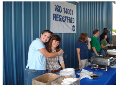
It was a team effort for Underground Utilities' Customer Service Week celebration.