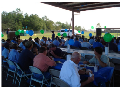
Staff enjoys the goodies at Underground Utilities' Customer Service Week celebration.