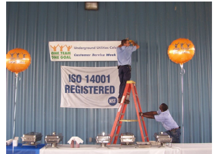
Underground Utilities gets ready for Customer Service week in October.