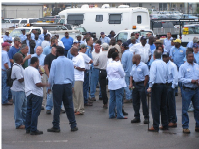
The crowd was gathered, despite less than ideal weather, for the United Way Kick-Off event at Messer Field.