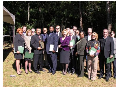
City officials and staff posed for a picture at the Cascades Park event after EPA awarded the City of Tallahassee the first ever Excellence in Site Reuse Award.