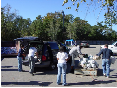
Citizens turned out with lots of CANtributions during CANpaign 2008.