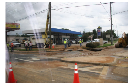
Crews work to repair the intersection at Capital Circle Southeast and Apalachee Parkway in the aftermath of Tropical Storm Fay.