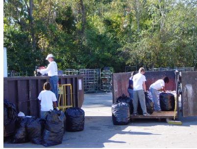
Volunteers helped City employees collect the CANtributions.