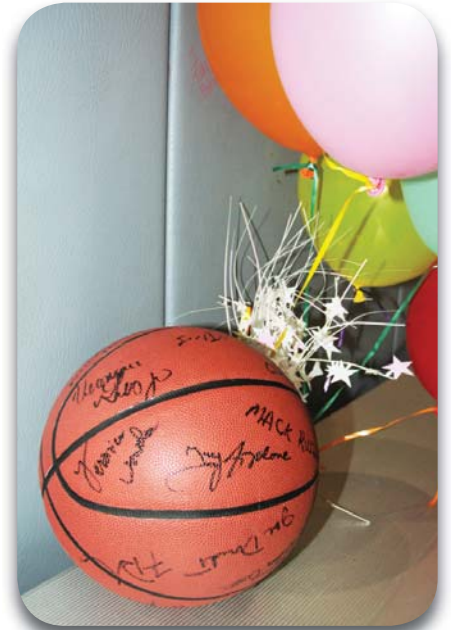
All of the Lin-credible winners signed the championship basketball, which was raffled away after the ceremony.