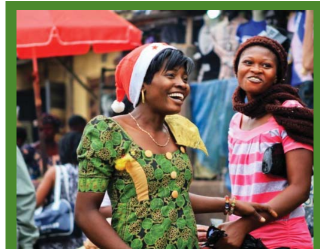
A woman in Nigeria adds a Santa hat to her outfit to celebrate the holidays.

General Nigerian foods. There is not as much of an emphasis on the "big Christmas dinner."