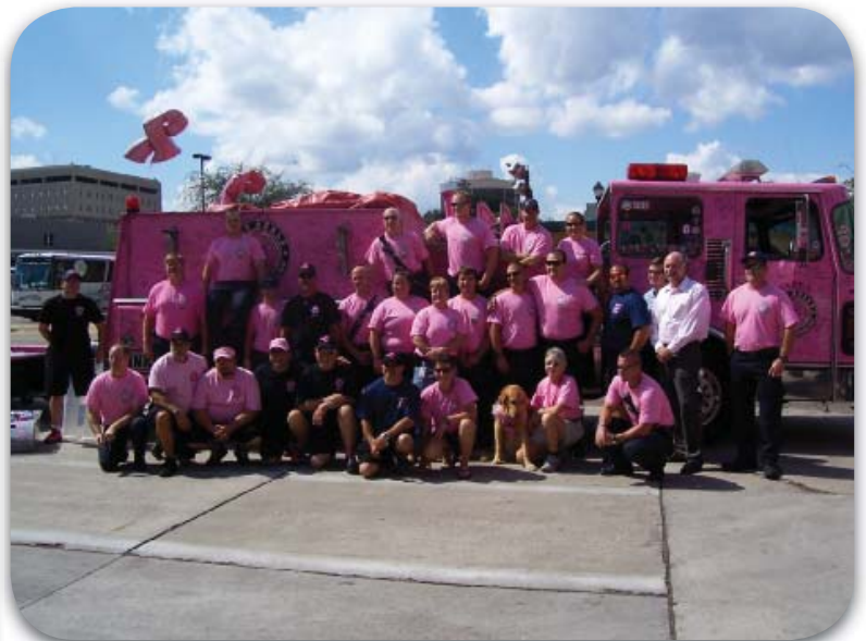
The Pink Heals Tour group poses with Tallahassee Fire Department staff in front of one of their signature pink fire trucks.