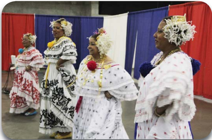
Dancers added entertainment to the lunch during the summit.