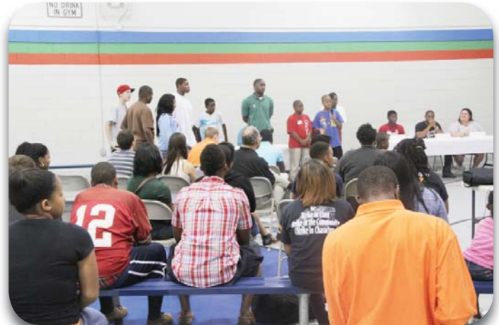
Teens participated in the "Victory over Violence" campaign at an evening event hosted at the Palmer Munroe Teen Center.