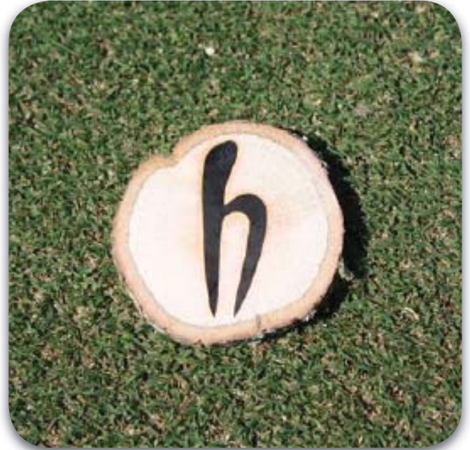
People received these as a keepsake. Several small pieces of the tree were taken and made into decorative items.