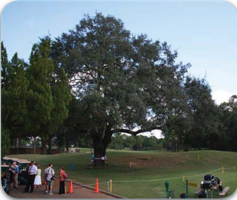
The tree before it was removed.

In June 2011, the historic live oak located on the Hilaman Golf course was struck by lightning, and it was determined that the tree would have to be cut down. On September 27, 2011, golfers, City leaders and City employees gathered around the tree to say goodbye.