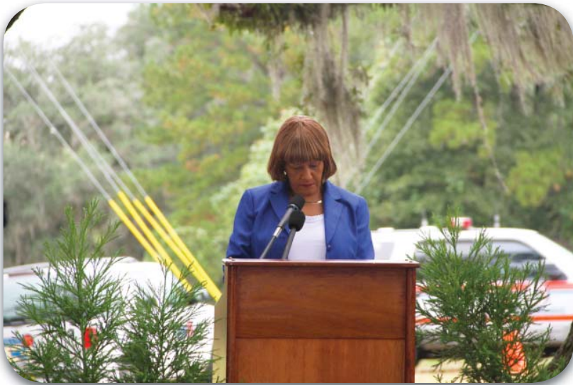
City Manager Anita Favors Thompson takes a moment to organize her thoughts before the event.

The groundbreaking ceremony for the planned Public Safety Complex was held past October. The new, $45 million complex will house the public safety emergency communications center. The PSC will also include a regional transportation center and other public safety operations. The 90,000 square foot facility is expected to be completed spring 2013.