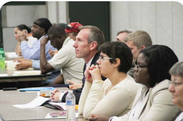
Summit attendees listened to and participated in various workshops designed to highlight an appreciation of human diversity.