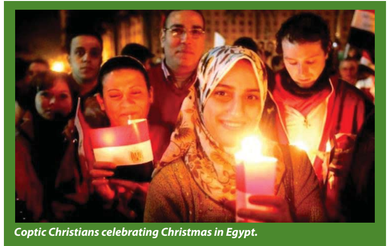
Coptic Christians celebrating Christmas in Egypt.

Turkey, stuffed grape leaf, baklava, wedding cake.