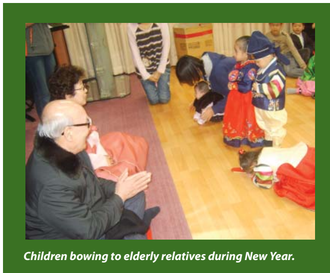
Children bowing to elderly relatives during New Year.

We still celebrate our holidays primarily because of my parents and relatives that we continue to keep in touch with. I often experience these even here because of some Asian restaurants here in Tallahassee.