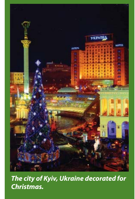
The city of Kyiv, Ukraine decorated for Christmas.

It is a twelve-course meal that is dedicated to Christ's twelve apostles. The meal usually begins with a bowl of kutya, a mixture of cooked wheat, honey, poppy seeds, chopped nuts, and apples. This is followed by several fish dishes, mushrooms, holubtsi (stuffed cabbage), varenyky (dumplings filled with cabbage, potatoes, or prunes), fruits, cakes, such as makiwnyk (poppy seed cake), and bread.