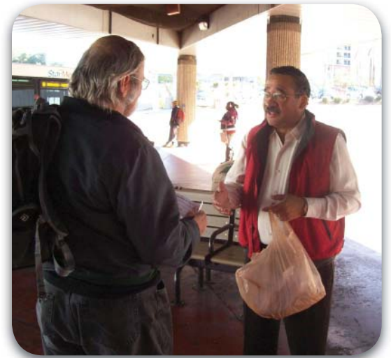
Mayor Marks speaks with a bus rider to ensure he knows about the StarMetro route changes.