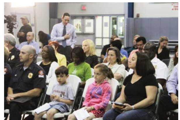
The award winners also brought family and friends to cheer them on.

More fun from the Lin-credible Awards Ceremony in Images From Around the City.