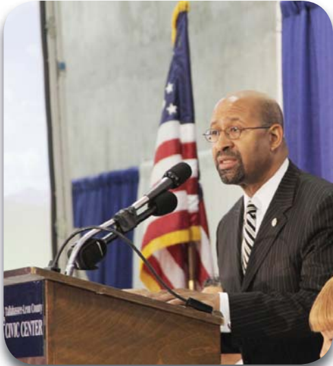
(L) Mayor Michael Nutter of Philadelphia speaks to the crowd about how to improve conditions for African American males and the community in general.

Held on April 9 and 10, the theme of the this year's Mayor's Summit was "World Conversations, Local Implications." The community heard from dynamic national and local experts and participated in discussions to actively promote an understanding, appreciation and awareness of human diversity.